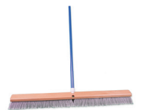
APPLICATION BROOM PRODUCT NUMBER: BHFC