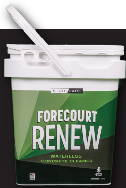
WATERLESS CONCRETE CLEANER